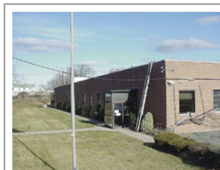
Oradell Animal Hospital, in Paramus, N.J., took one year to plan and one year to remodel.