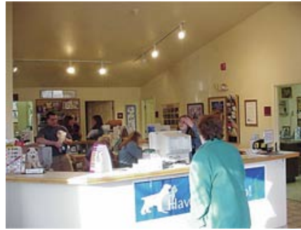
Deer Creek Animal Hospital, in Littleton, Colo., spent five months planning for a remodel and another six-and-a-half months in construction.